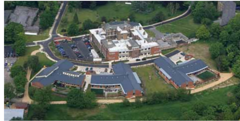
1) Newton Abbot Community Hospital , built under PFI contract. Architect: Murphy Philipps.