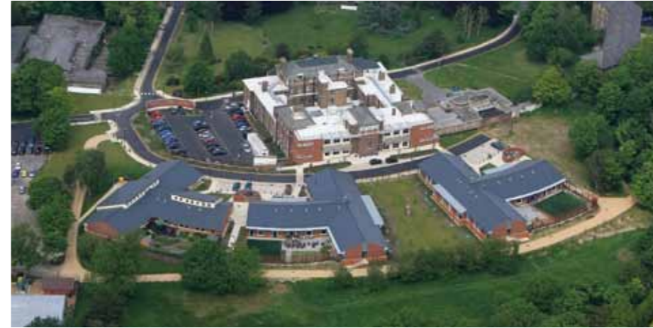
1) Newton Abbot Community Hospital, built under PFI contract. Architect: Murphy Philipps.